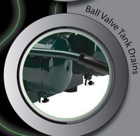
Ball Valve Tank Drains