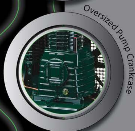
Oversized Pump Crankcase